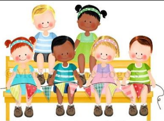
After School Care

NO After School Care TODAY Tuesday 13 th December